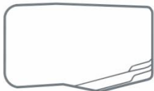
9.1m Soft Rectangle

This formal pool is ideal for smaller spaces, with a modern extended step entry. The pool offers space for laps which makes turning easier. The pool includes generous seating and a non-skid floor.